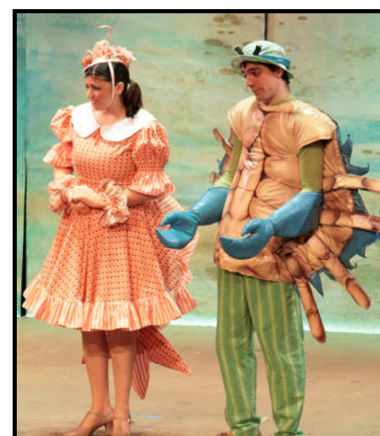
Shrimp Russell's kind and warm friend who suggests going to see the wise Sea Turtle