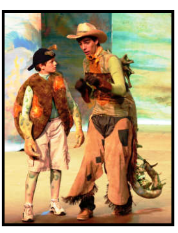
caring buddy who Russell figure out